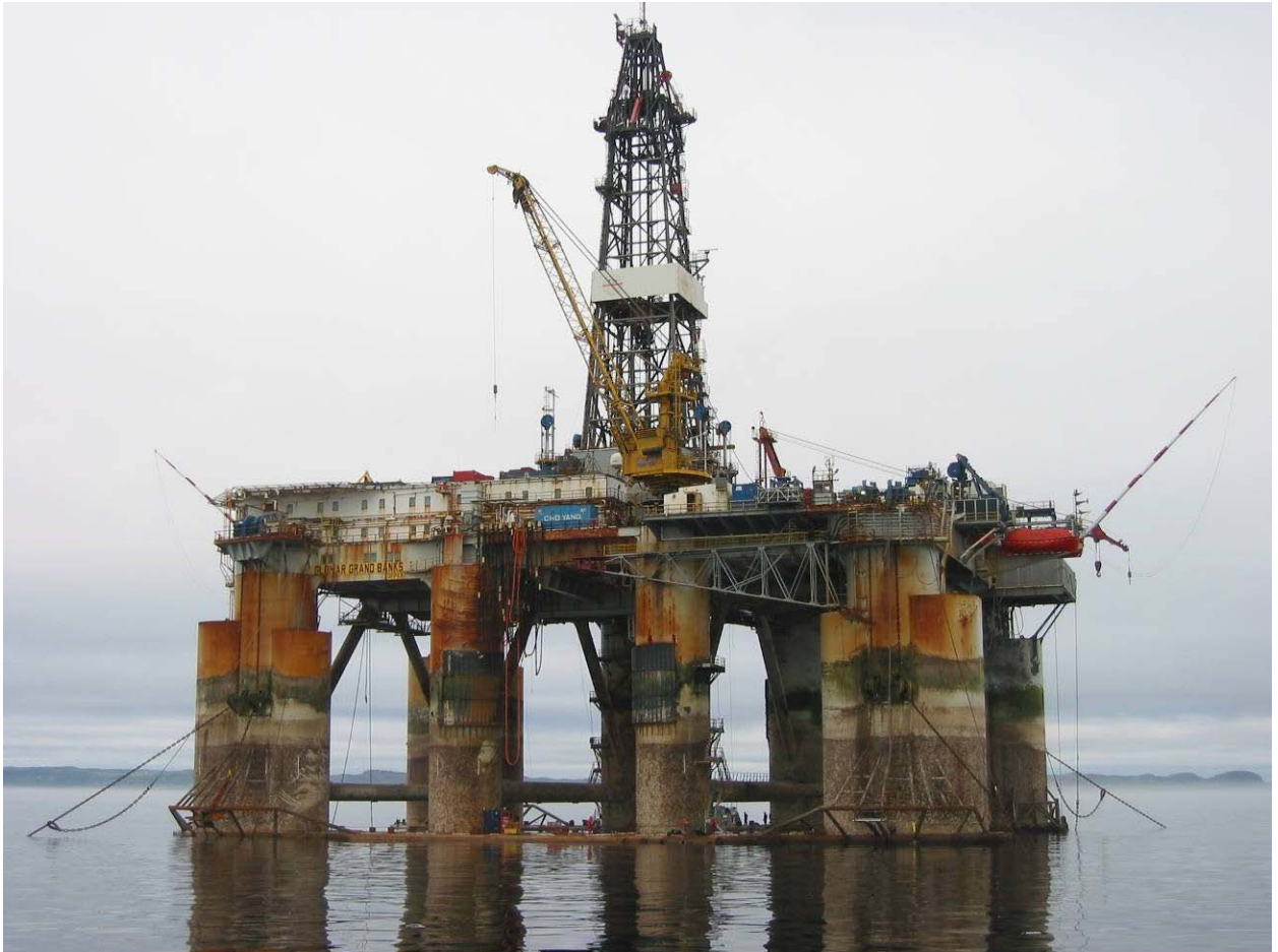
Glomar Grand Banks in Conception Bay for Inspection and repairs, May 2006