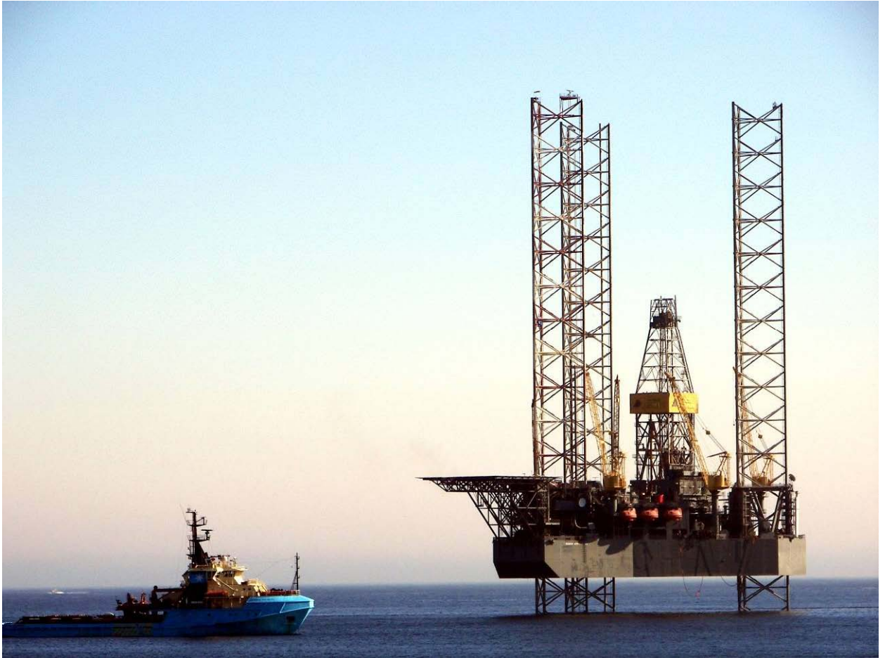
Rowan Gorilla VI Jackup Rig