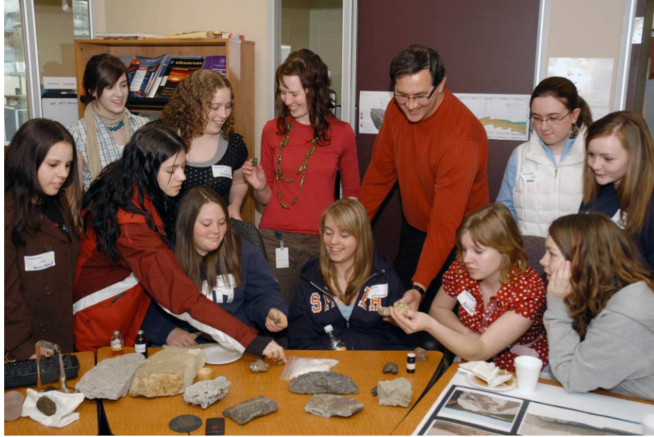
Techsporation Class Visit Husky's Sub-surface office in May 2007