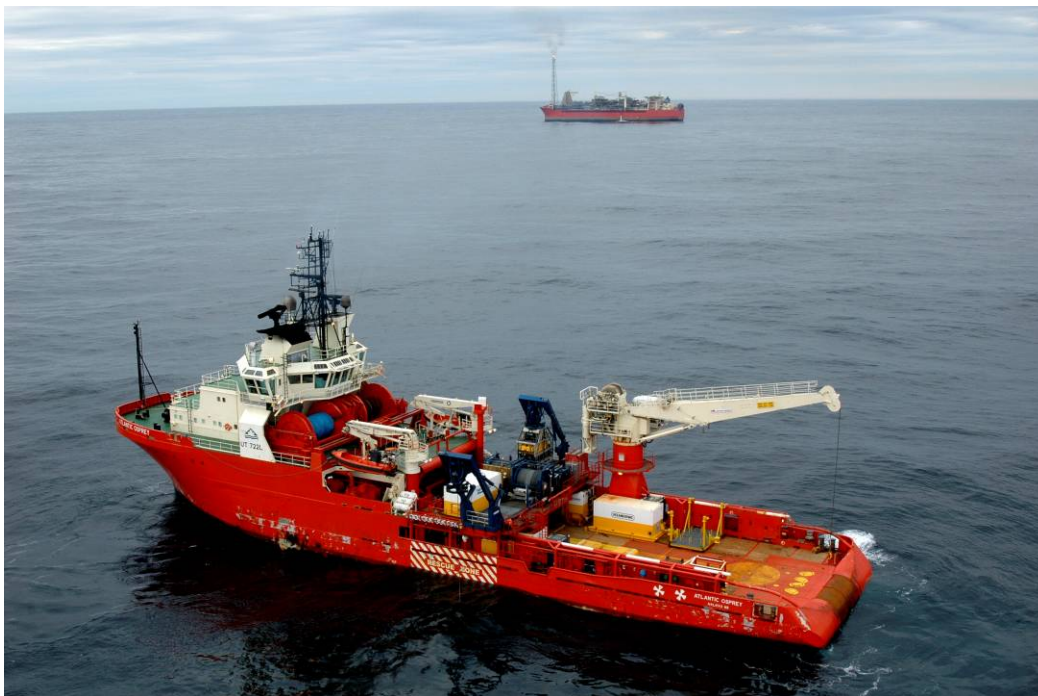
Diving Support Vessel Osprey With SeaRose in Background