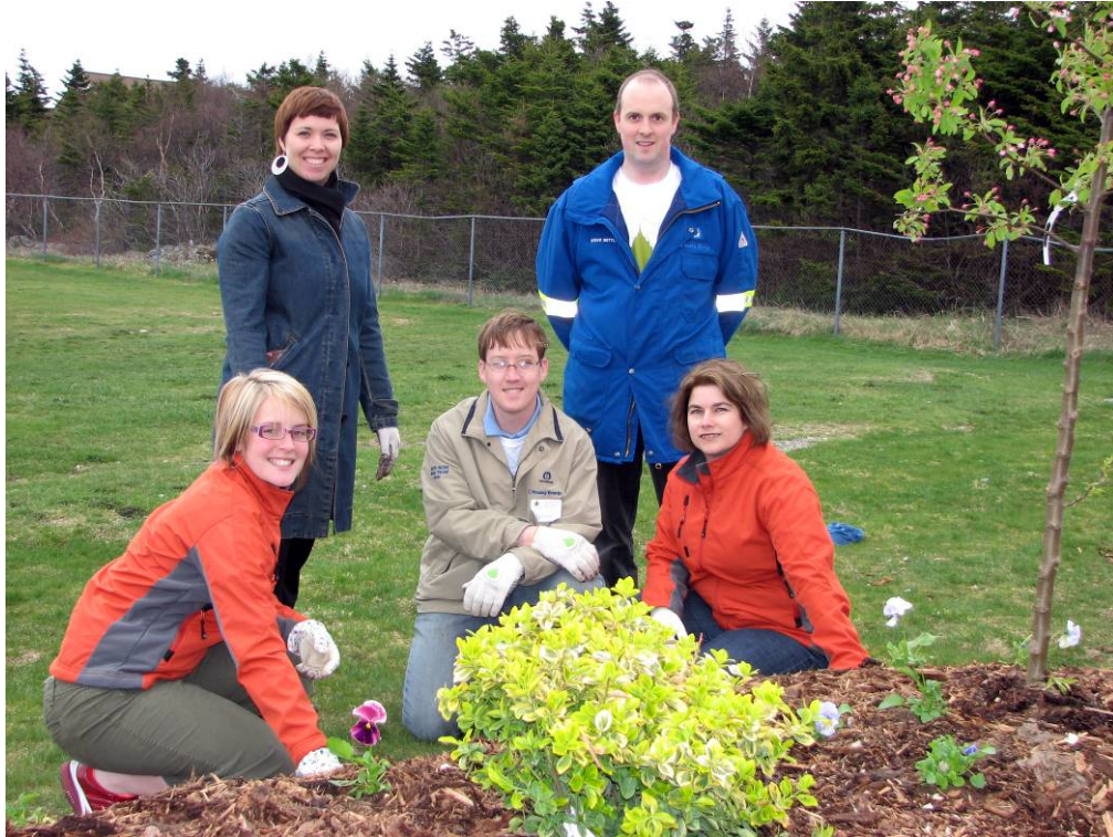
Husky Staff Plant Trees at St. Andrews School during Energy in Action Week Sponsored by CAPP