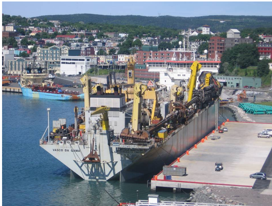
Vasco da Gama at Pier 17