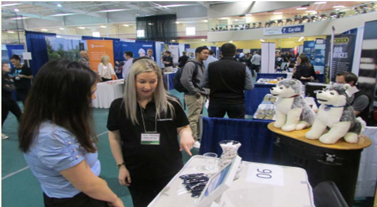
Husky Attends MUN Career Fair – August 2015