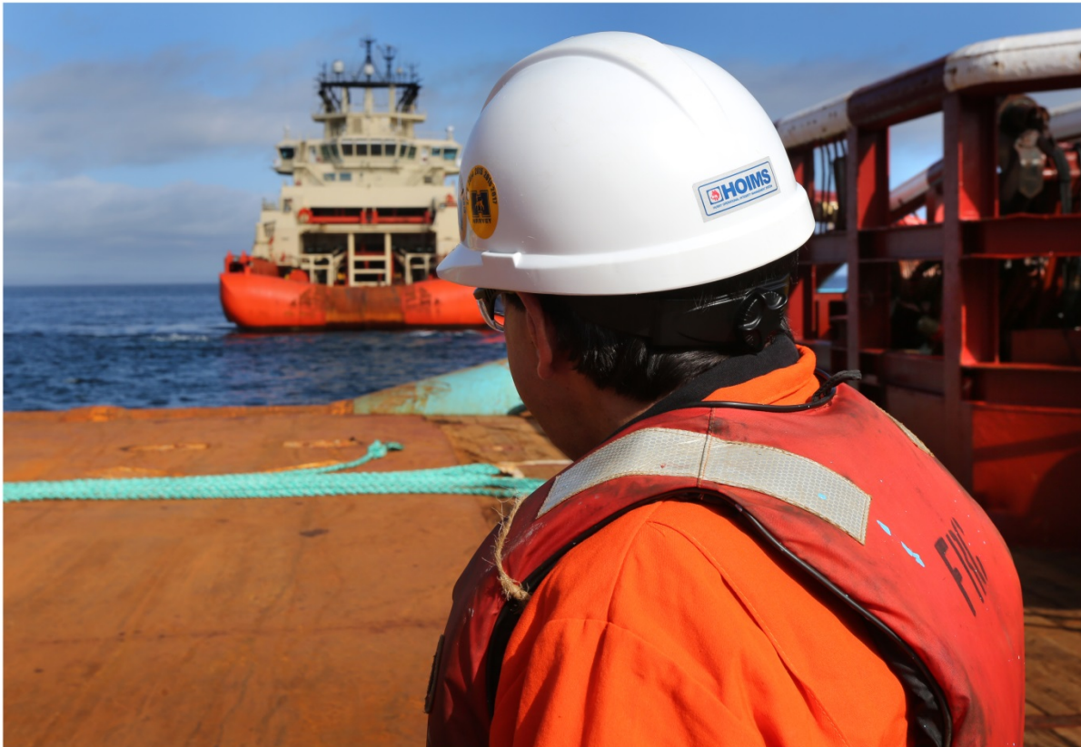
Husky Hosts Synergy Exercises - September 2015