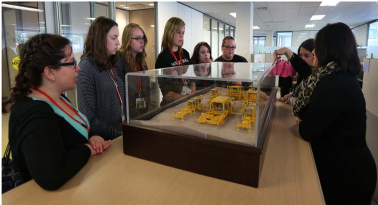
Husky Supports the WISE (Women in Science, Technology and Engineering) Program with Guided Tours and Information Sessions – August 2015