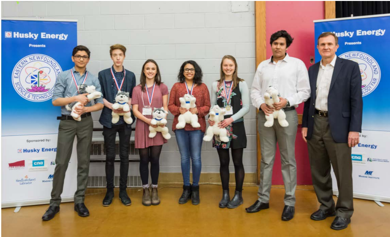
Husky Energy Eastern Science and Technology Fair – April 2017