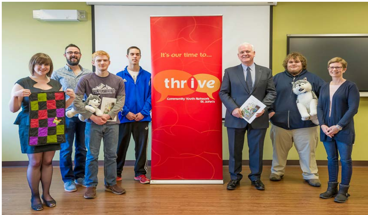
Husky donates to Thrive GED program – May 2017