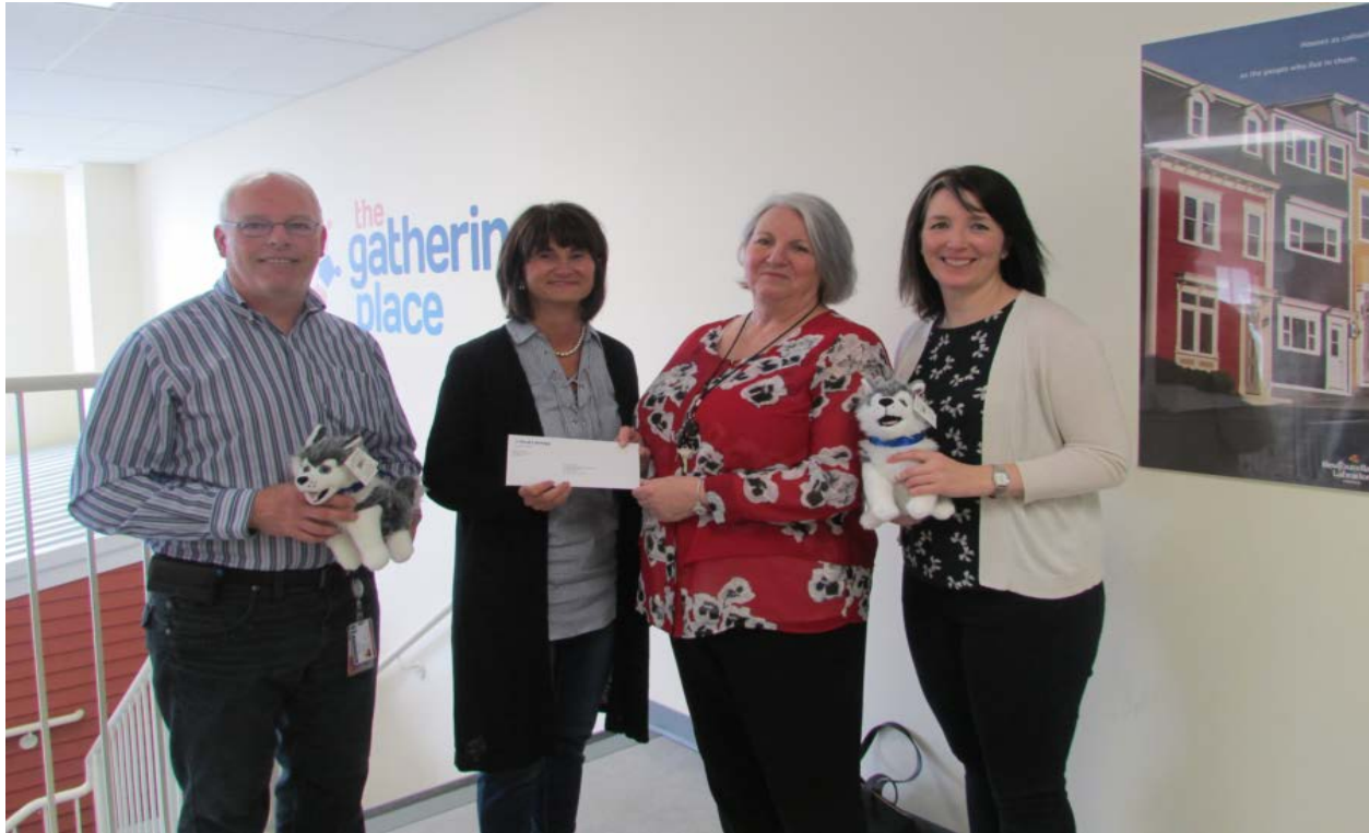
Husky makes donation to the Gathering Place during North American Occupational Safety and Health Week – May 2017