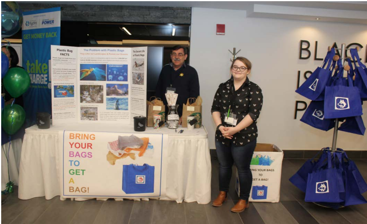
Husky employees gather for Earth Day – May 2017