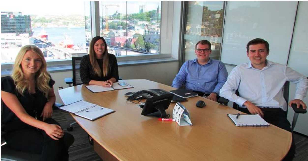
Co-op students participate in student mentoring program – June 2017