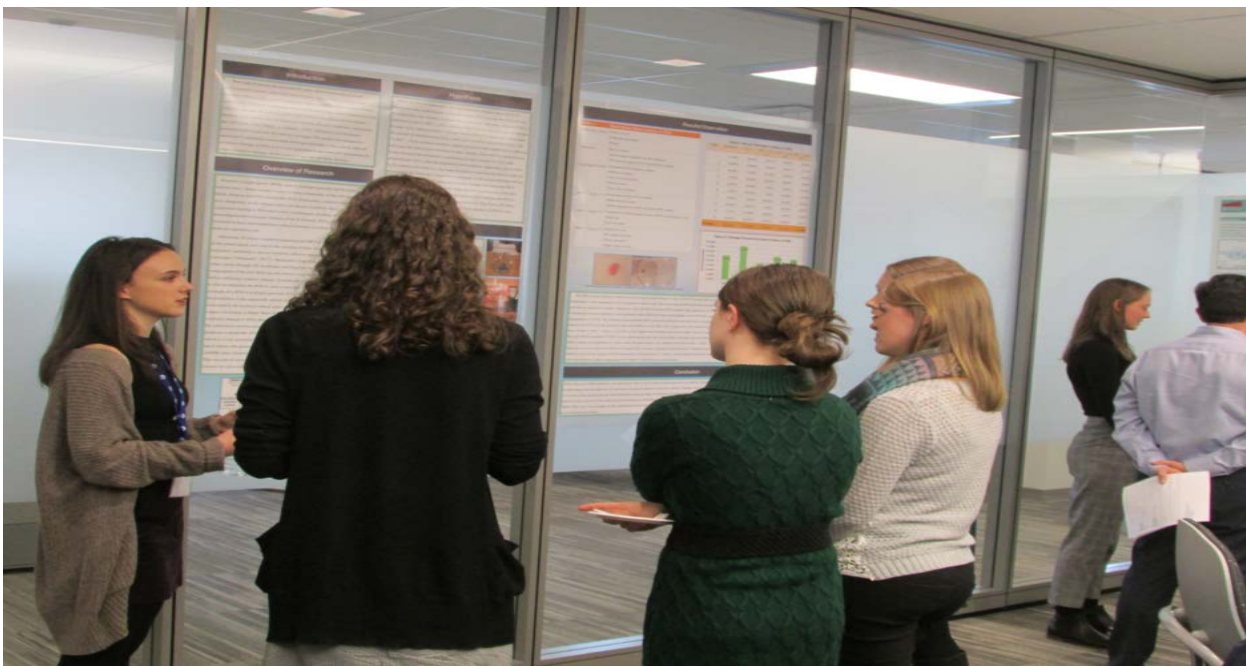
Science Fair finalists present their projects to Husky employees – May 2017