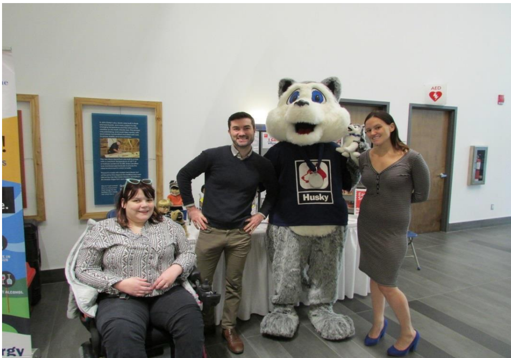
Husky hosts it's Atlantic Region Wellness Fair to encourage further education on health and wellness – November 2017