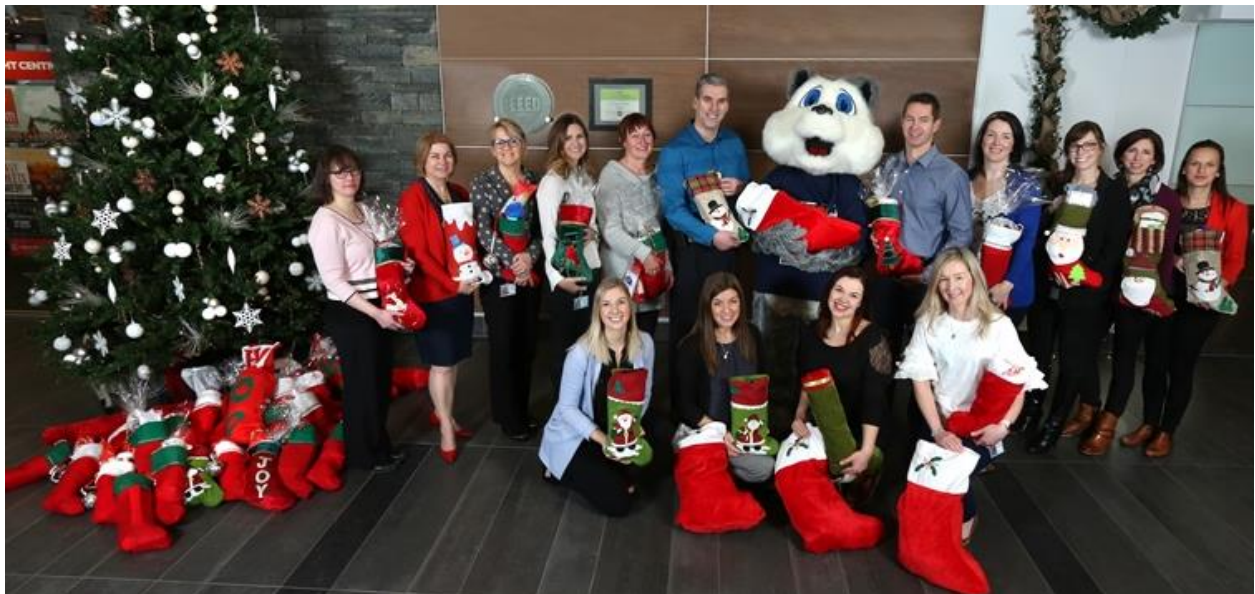
Husky staff gather to donate stockings full of items for the patients at Daffodil Place – December 2017