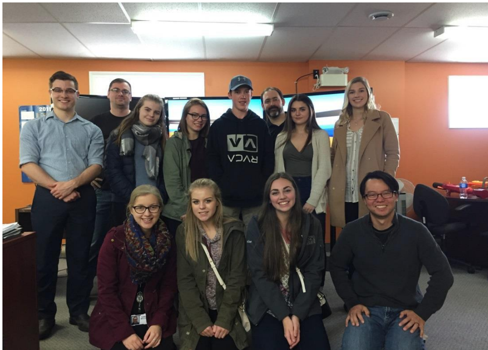
Husky hosts its annual Take Your Kids to Work Day, which included a Virtual Marine tour – December 2017