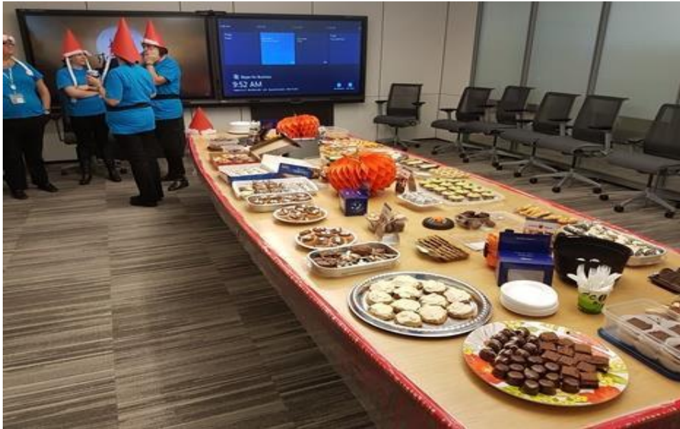
Husky's Document Control team arranges a Halloween bake sale to raise funds for the Alzheimer Society of NL – October 2017