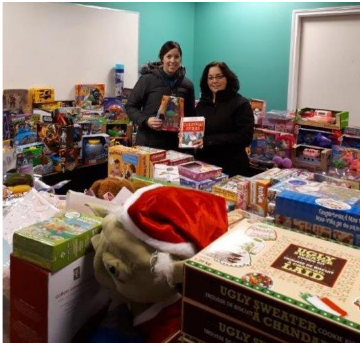
Members of Husky's Finance team donates gifts to the Single Parents Association of NL – December 2017