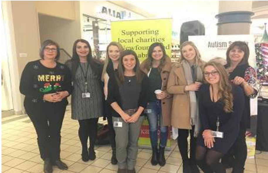
Husky employees answer phones at the VOCM Autism Society Radiothon – December 2017